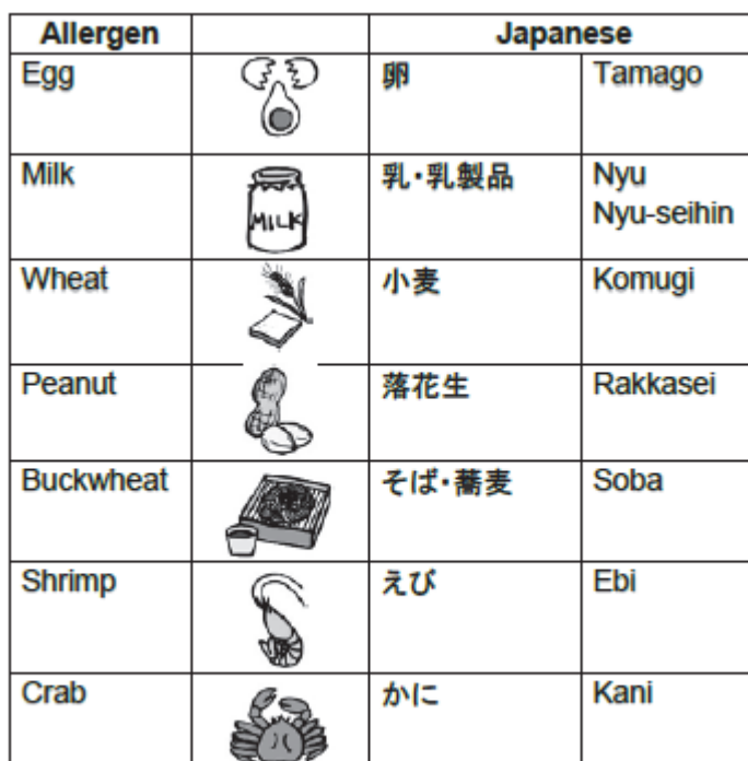
Top 7 Allergens Labeled in Japan

Remember, never be embarrassed if you feel you are not communicating effectively. If a member of the wait staff doesn't seem to understand your situation, always trust your instincts and seek out another staff member or manager. Sometimes, the safest choice is to avoid eating, and find a safe meal somewhere else.